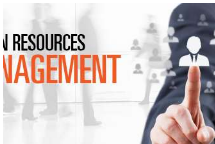
Human Resource Management