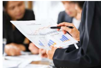
Economic & Finance