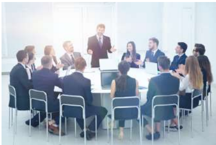
Business & Management